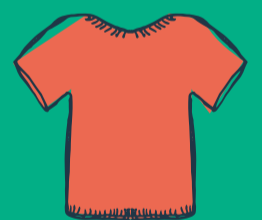
Clothing & Textiles

Barwon South West households throw away an average of 3kg of food every week! Over 99% of this material ends up in landfill.